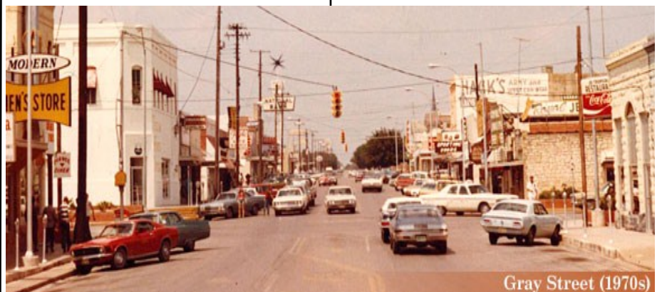
Gray Street (1970s)

designs and dramatic features. In just a few historic blocks you can experience both periods of growth in our history and enjoy the unique and authentic environment that Downtown Killeen has to offer. Visit downtown today and explore where our story began.