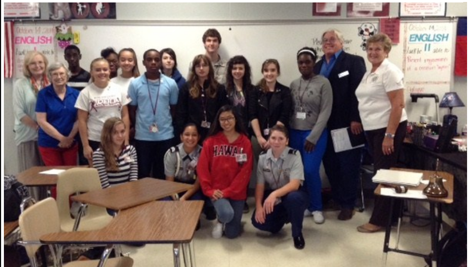
Commission addresses the club.